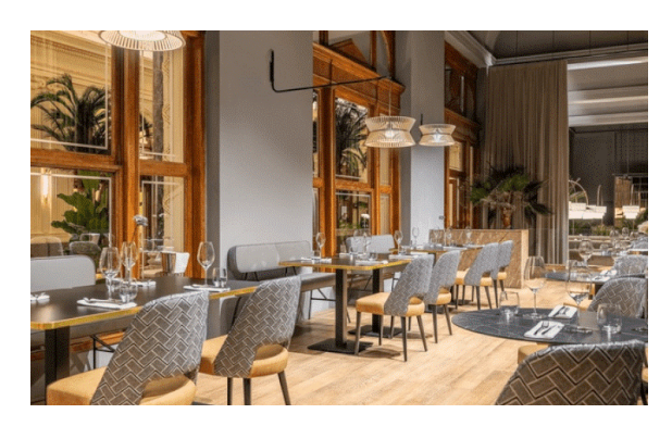
1890 Restaurant & Bar invites guests to a dining experience rooted in history

NH Collection Prague Carlo IV presents new 1890 Restaurant & Bar