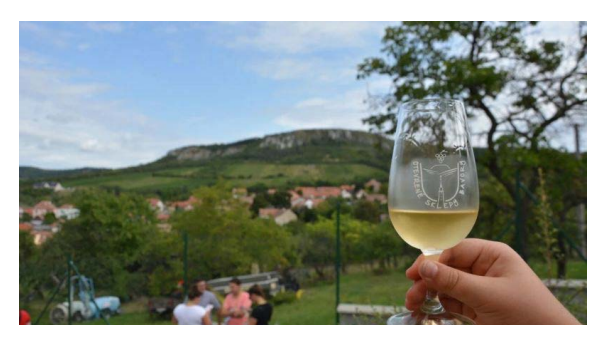
The wine cellars in Dolní Dunajovice and Březí will be open until Sept.