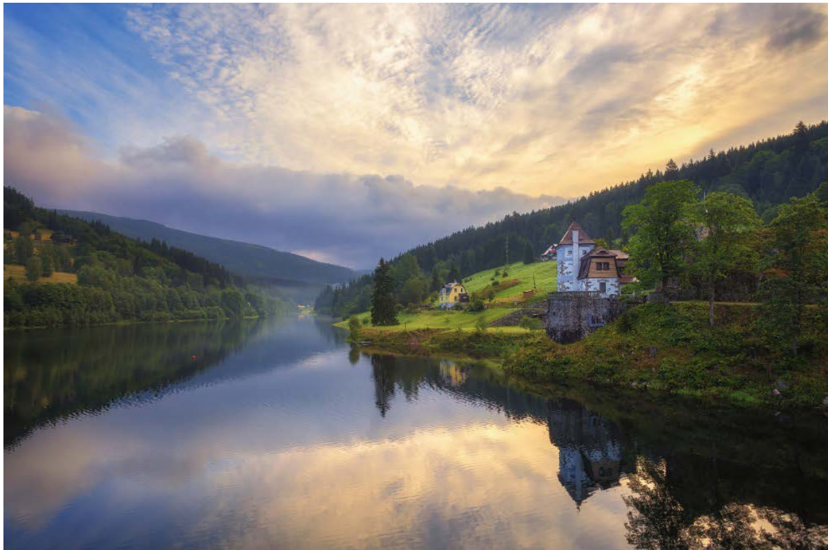
The Elbe River