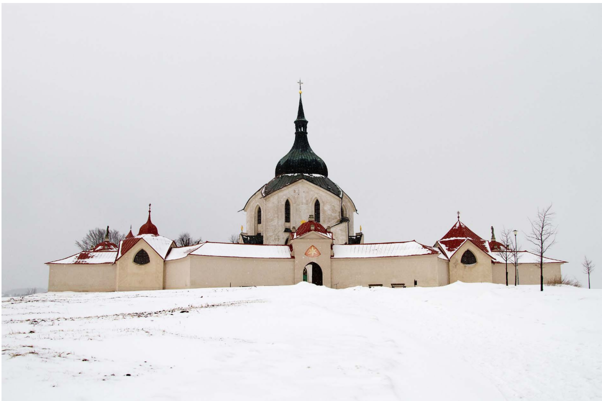
Pilgrimage church of St John of Nepomuk at Zelená hora